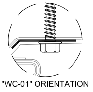
PANEL JOINT (PLAN VIEW)

NOTE: FILL INTERIOR (LINER) SIDE CAVITY WITH 3/8" DIAMETER BEAD (APPROXIMATE) OF NON-SKINNING BUTYL SEALANT (DO NOT UNDER-FILL).