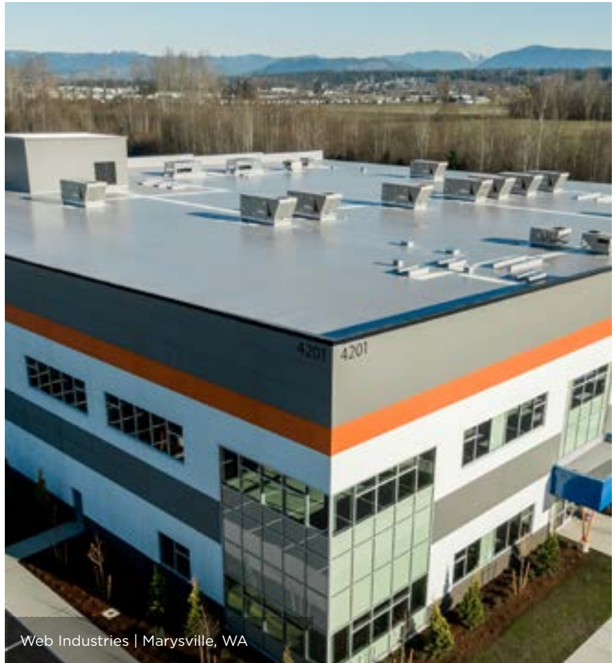
Web Industries | Marysville, WA