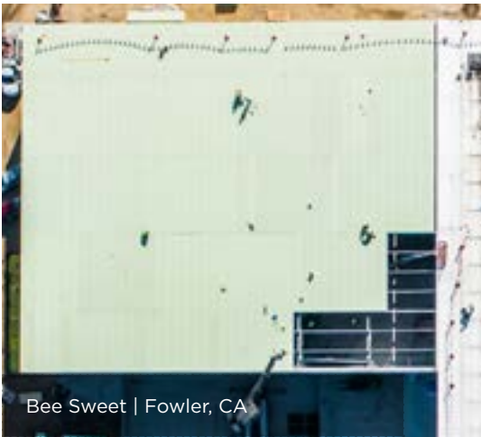
Bee Sweet | Fowler, CA